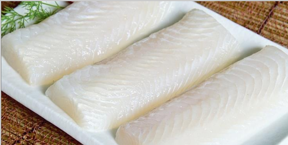
Frozen Pangasius fillets (US$ 7 millions)

... Also is our second main supplier of mobile phones (second only to China).