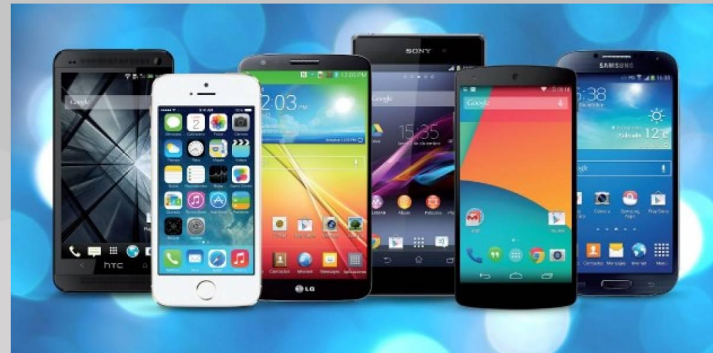
Mobile phones (US$ 408 millions)